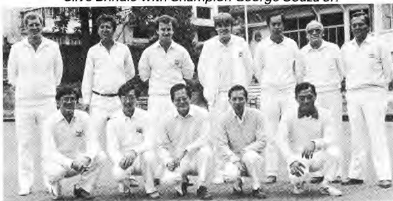
This Year's Line-up