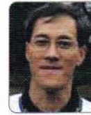
Stanley Ho - STSA