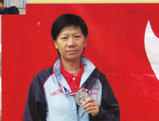
Asian Bowls – Singles Silver