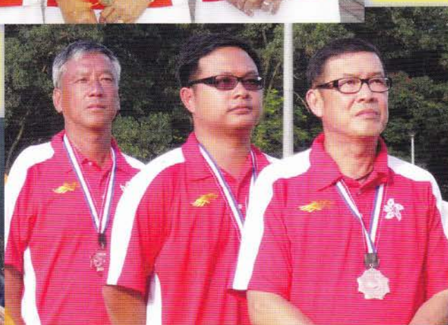
Asia Pacific Bowls – Triples Bronze