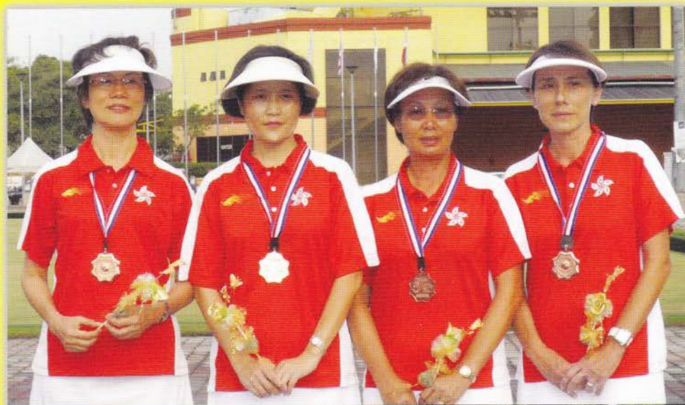
Asia Pacific Bowls – Fours Bronze