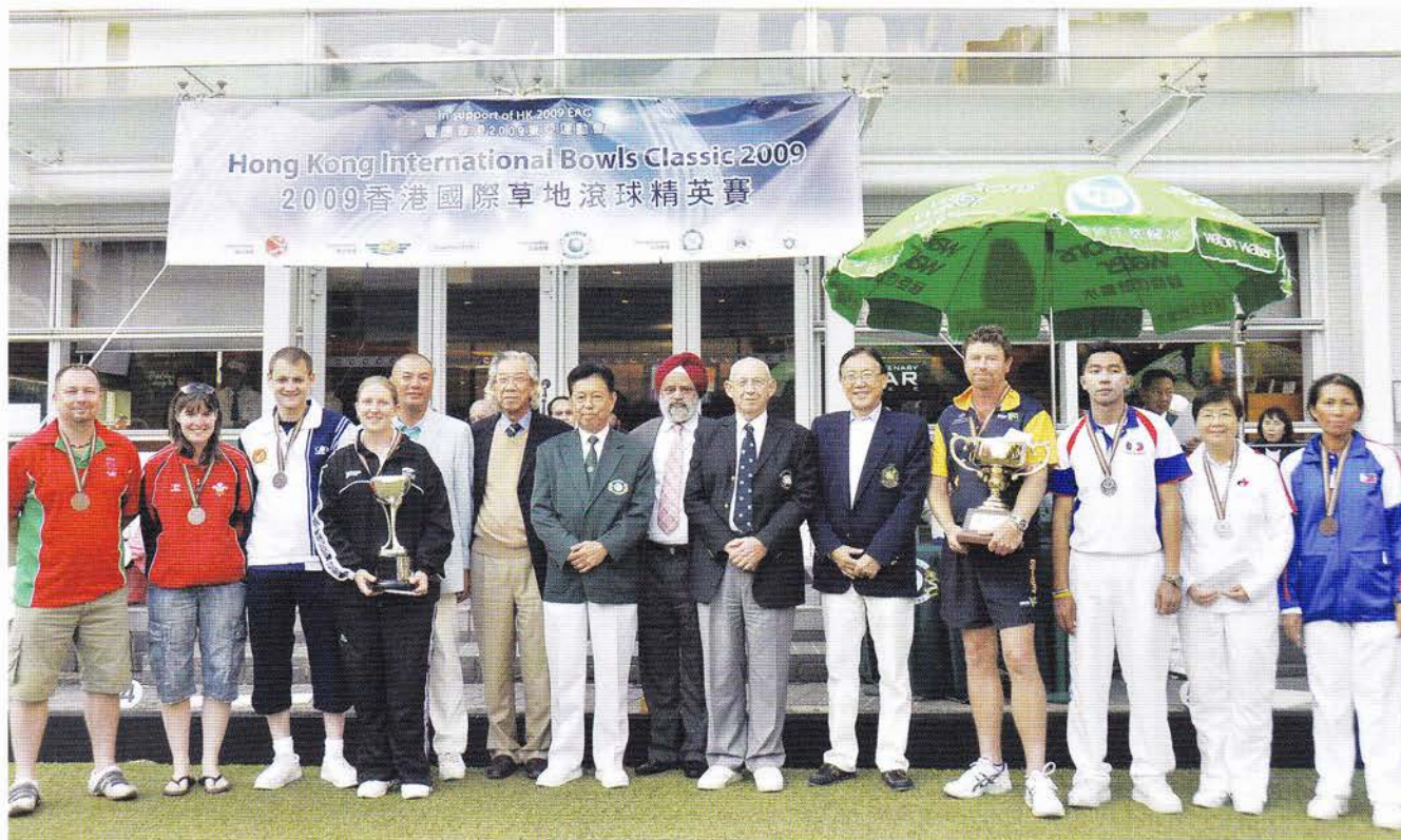
Hong Kong International Bowls Classic 2009 2009香港國際草地滾球精英賽