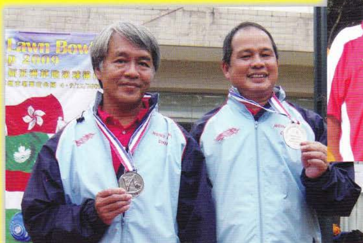
Asian Bowls – Pairs Silver