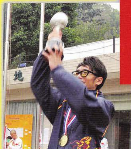
Asian U25 – Singles Gold