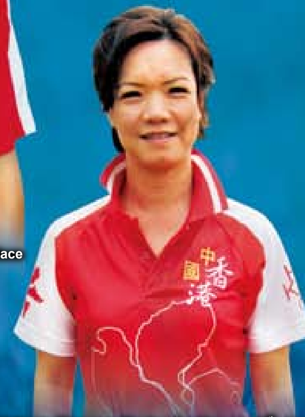
World Bowls Women's Singles Ranking no. 11 th place