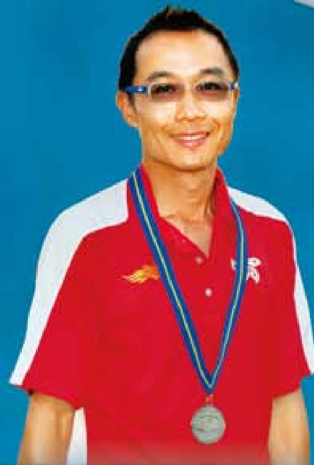
World Champion of Champions -Silver World Bowls Men's Singles Ranking no. 12 th place