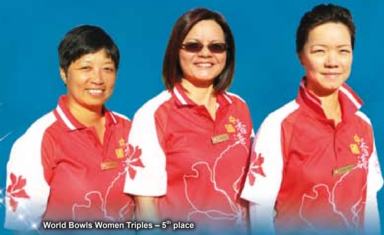
World Bowls Women Triples – 5 th place