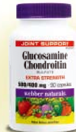
Glucosamine Chondroitin Sulfate (Extra Strength)