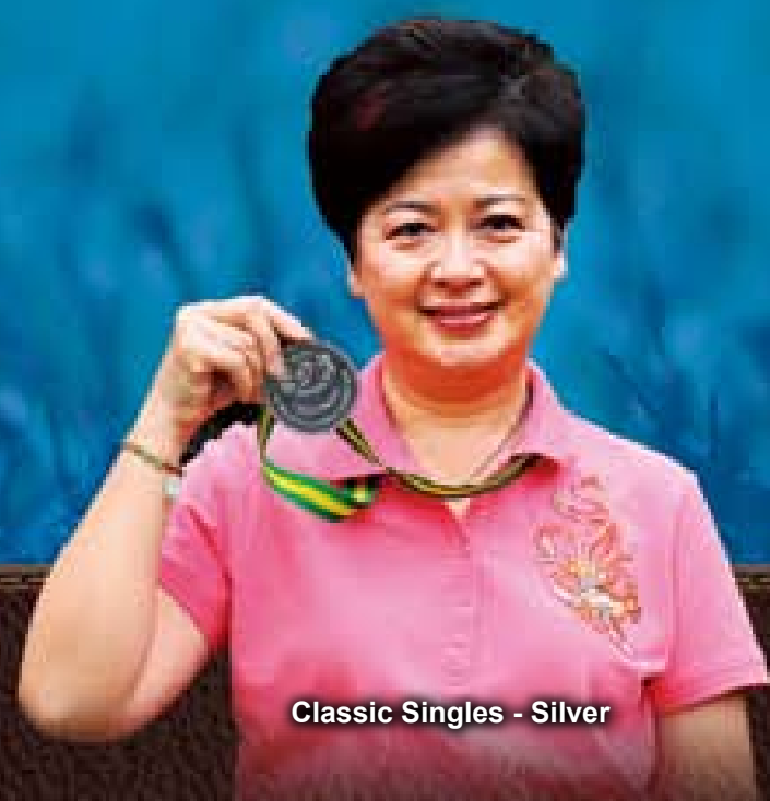
Classic Singles - Silver