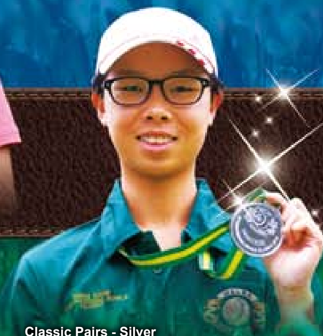
Classic Pairs - Silver